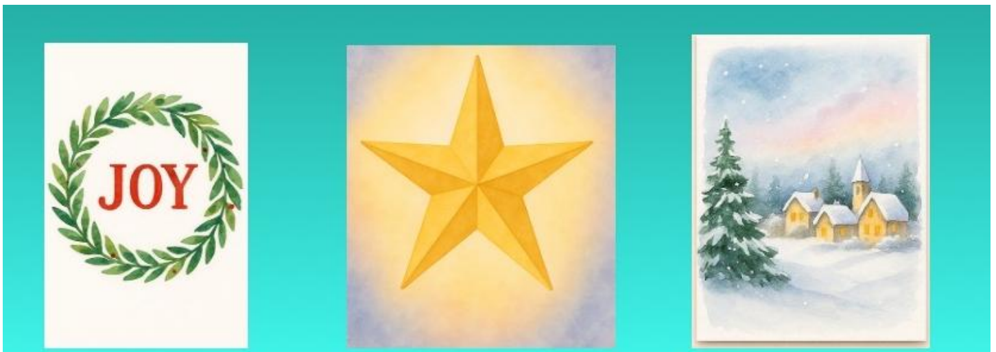
Photo of finished projects